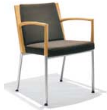
K55CC Full Height Back Cushion 22" W 24½" D 31" H