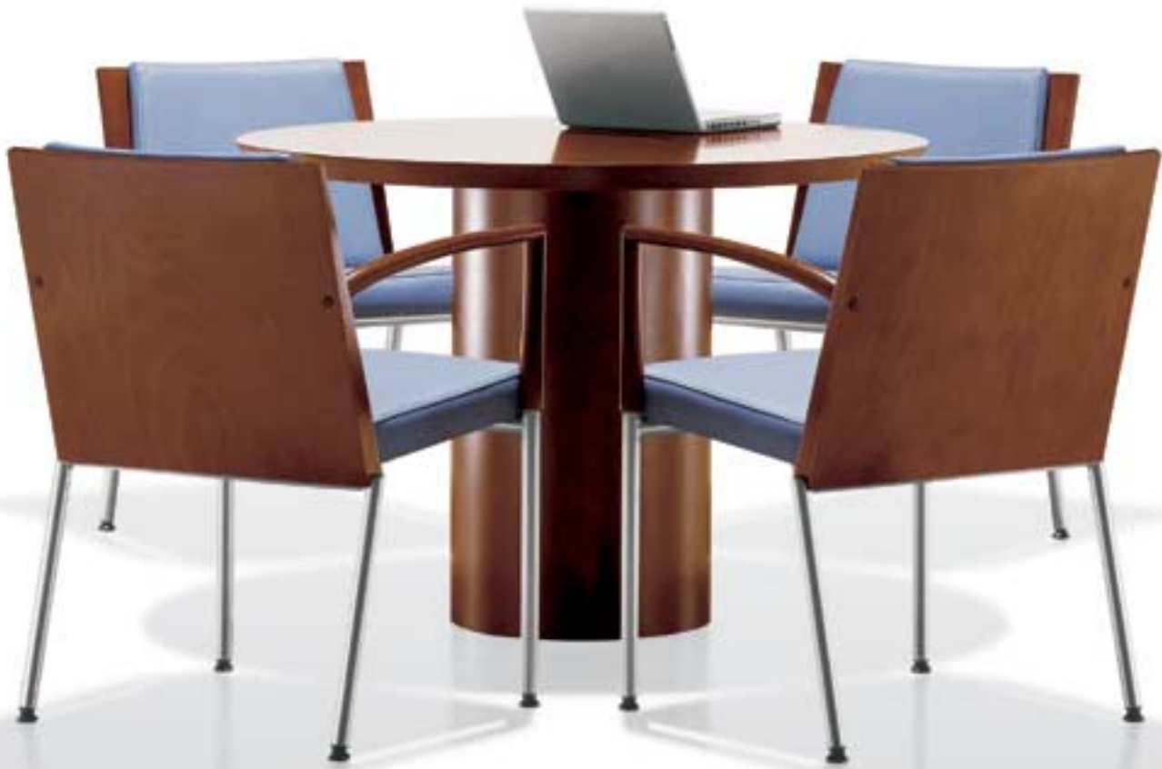
Product specifications: (top) Adagiato K55AA, Pollack Flutter 2211/05 lagoon, Honey and Platinum Metallic finishes; Cetra system with Footprint worksurfaces and storage; (bottom) Adagiato K55CC, Showcase 80101 Sky, Ginger and Satin Nickel Metallic finishes; Contemporary table.