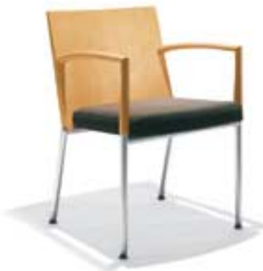
K55AA Wood Back 22" W 24½" D 31" H