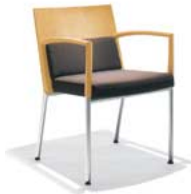
K55BB Half Height Back Cushion 22" W 24½" D 31" H